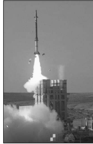
Figure 9. David's Sling Launches Stunner Interceptor

Israel first used David's Sling in July 2018. At the time, Syrian regime forces were attempting to retake parts of southern Syria as part of the ongoing conflict there. During the fighting, Asad loyalists fired two SS-21 Tochka or 'Scarab' tactical ballistic missiles at rebel forces, but the missiles veered into Israeli territory. David's Sling fired two Stunner interceptors, but the final impact point of the Syrian missiles changed mid-flight, and Israel ordered one of the interceptors to self-destruct; the other most likely landed in Syrian territory. 115 Chinese media claimed that Asad regime forces recovered the Stunner interceptor intact and handed it over to Russia; the Israeli government did not comment on this assertion. 116