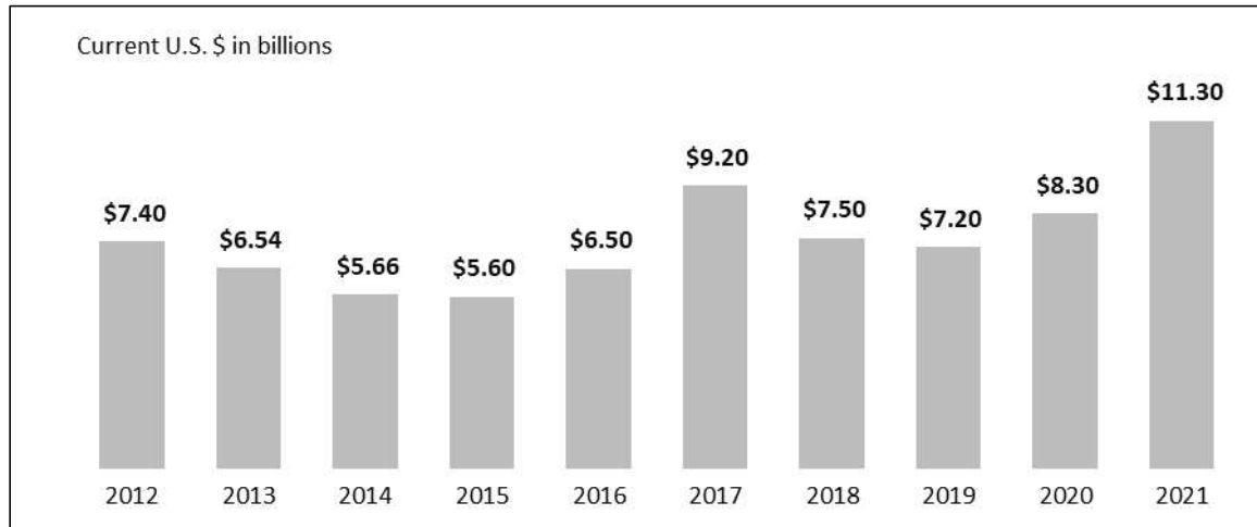
Figure 1. Israel's Annual Arms Exports: 2012-2021

Source: Created by CRS. Information from Israel Ministry of Defense, International Defense Cooperation Directorate (SIBAT), as reported by various media sources.