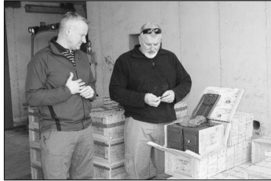
Figure 10. Army Officers Inspect WRSA-I