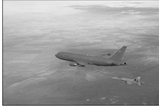
Figure 6. The KC-46A Pegasus