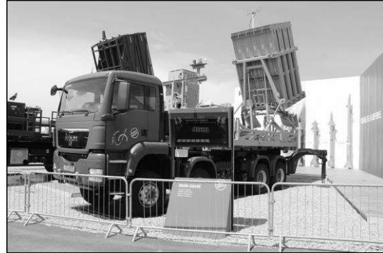
Figure 8. Iron Dome Launcher

In March 2014, the U.S. and Israeli governments signed a co-production agreement to enable the manufacture of components of the Iron Dome system in the United States, while also providing the U.S. Missile Defense Agency (MDA) with full access to what had been proprietary Iron Dome technology. 95 U.S.-based Raytheon is Rafael's U.S. partner in the co-production of Iron Dome. 96 In 2020, the two companies formed a joint venture incorporated in the United States known as "Raytheon Rafael Area Protection Systems (R2S)." Tamir interceptors (the U.S. version is called SkyHunter) are manufactured at Raytheon's missiles and defense facility in Tucson, Arizona and elsewhere and then assembled in Israel. Israel also maintains the ability to manufacture Tamir interceptors within Israel.